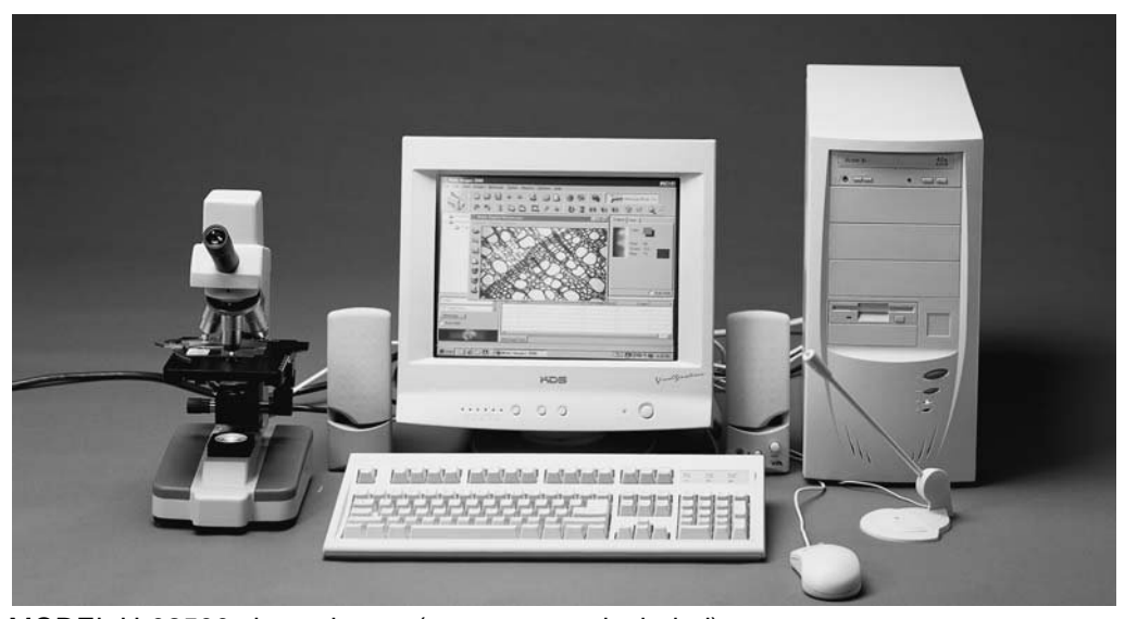
MODEL U-02500 shown in use (computer not included) Subject to changes in material and design, equal to or exceeding those described above.