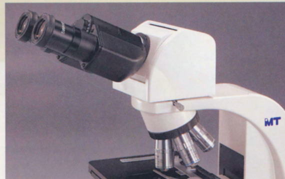
MA957 ERGONOMIC TILTING BINOCULAR HEAD (SIEDENTOPF TYPE)