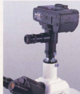
MA150/60 Camera attachment

These attachments are used to mount the camera with T2 adapter ring to the photo tube.