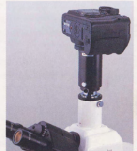
MA150/50 Camera attachment