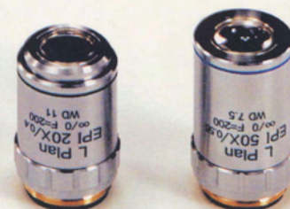
LWD (LONG WORKING DISTANCE) PLAN EPI OBJECTIVES