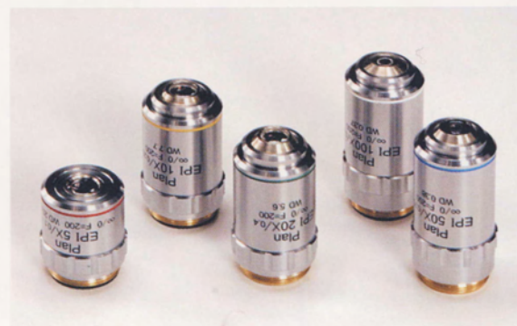
PLAN EPI OBJECTIVES