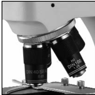
High quality semi-plan objectives