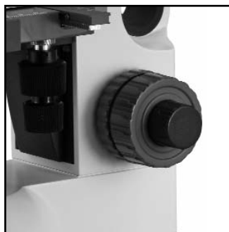
Easy to use coaxial focusing