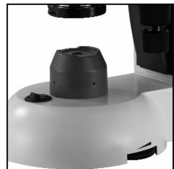
Variable illumination intensity control

Modern Finish: Unless otherwise indicated, all instruments are finished in acid and reagent resistant, Swift epoxy-ester resin.