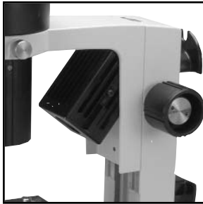
Adjustable light path assures optimal lighting of specimen