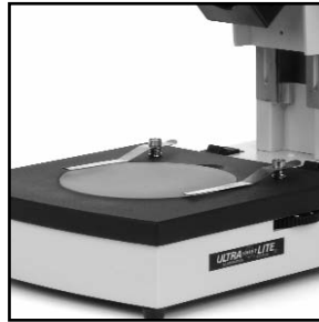
Extra large stage allows ample room for viewing specimen